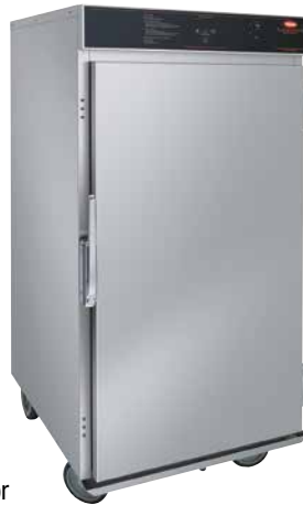
FSHC-12W1 with optional Stainless Steel door