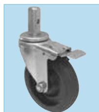
ALRC-5STK 5" caster with brake