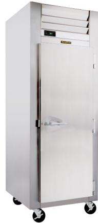
Model Shown One Section (shown with optional casters)