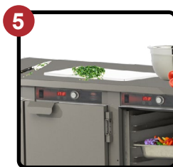
Stainless Steel Work Top