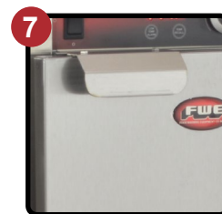
Work Flow Handle