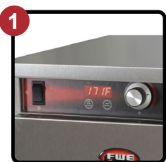
Individual Heat Controls