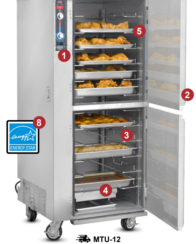
(Shown with Optional Accessory Dutch Doors)