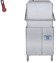
DYNASTAR® electric only

Coffee Shops • Quick Service Restaurants • <100-Seat Full Service Restaurants <125-Bed Health Care Facilities • Elementary Schools • Small Middle & High Schools