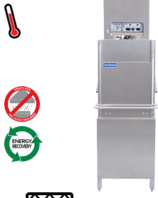
TEMPSTAR® HH-E VER electric only