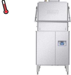
DYNASTAR® VER electric only