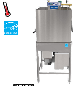
NXP-HTD electric only