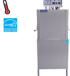
TEMPSTAR® electric only