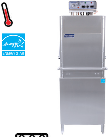
TEMPSTAR® HH-E electric only