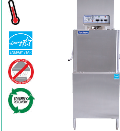
TEMPSTAR® VER electric only