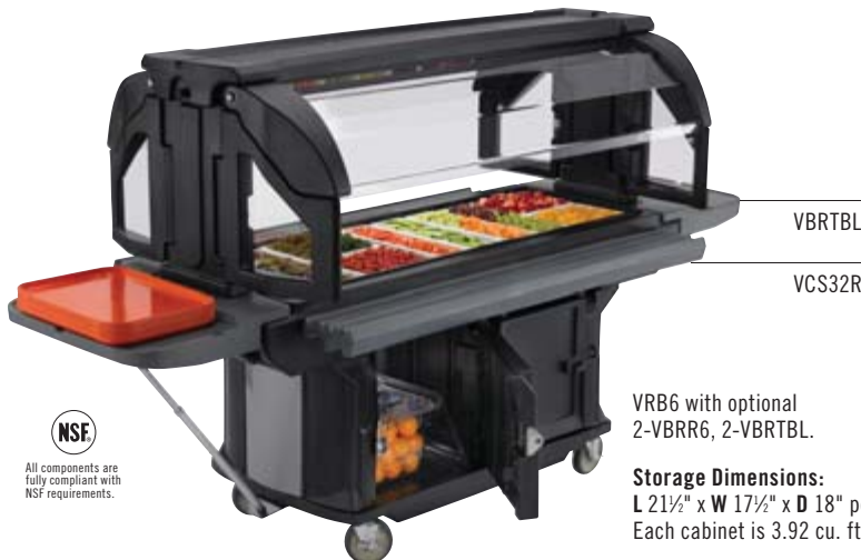
VBR6 with optional 2-VBRR6, 2-VBRT5L.

Storage Dimensions: L 21½" x W 17½" x D 18" per cabinet. Each cabinet is 3.92 cu. ft. (0,11 M³).