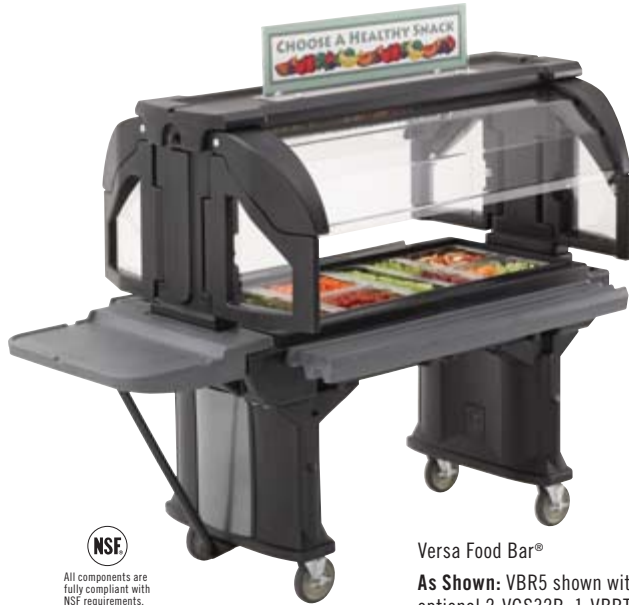
Versa Food Bar® As Shown: VBR5 shown with optional 2-VCS32R, 1-VBRT5L.

Whether you're looking to maximize space, improve traffic flow, add merchandising space or create an upscale salad bar, the Versa Food Service System has you covered.