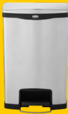
1901992 FRONT STEP