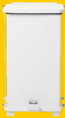
FGST12EPLWH 6.5 GAL