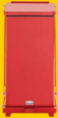
FGST12EPLRD 6.5 GAL