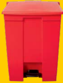
FG614500RED 18 GAL