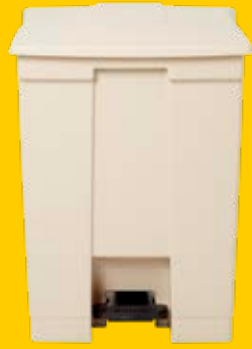
FG614500BEIG 18 GAL