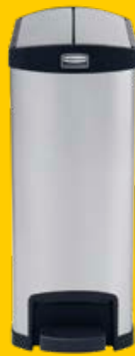
1901993 END STEP