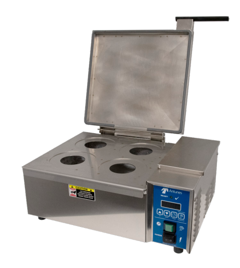
Dim Sum Accessory for DFW

With precise, high-performance steaming available at the press of a button, the Dim Sum Accessory makes it easier than ever to expand menus while saving space.