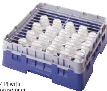
BR414 with CRPHDG2878

Keeps lightweight smallwares in place during wash cycle. Use on full size Camrack Base or Flatware rack.