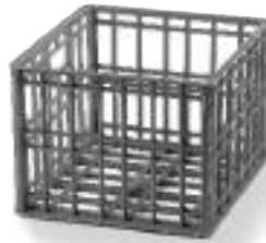
For 13" x 13" (33 x33 cm) Milk Crates (Not available by Cambro)