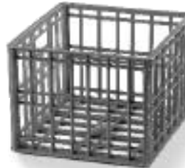
For 14" x 19" (36,5 x 48,3 cm) Milk Crates (Not available by Cambro)