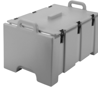
For Camcarrier (100MPC)