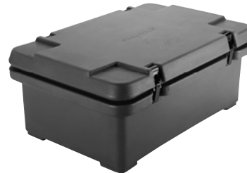
For Camcarrier (160MPC)