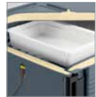
Thick foam insulation retains temperatures for hours, even when unplugged.

Both units are available in 110V and 220V models.