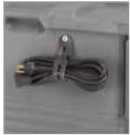
Removable cord stows securely for transport.

Tough, polyethylene exterior stays cool to the touch.