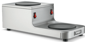
WCW20R Step-Up, Double-Burner Coffee Warmer