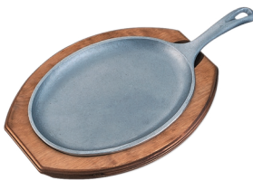
SK107BHC 9" X 12" X 1" Holder & Alum. Skillet