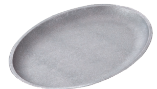
1016266 10" X 7.5" X 0.75" Oval Cast Iron Insert