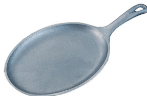
SK107CA 14.75" X 7.25" X 0.75" Aluminum Insert