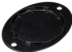
HS15BL2 9.25" X 9.25" X 0.75" Round HS Platter