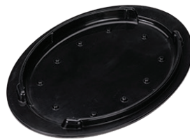
HS13BL3 10" X 7.5" X 0.75" Oval HS Platter