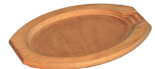
SK107BH 12" X 7" X 7" Birch Holder