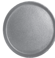
RP18 9.25" X 9.25" X 0.75" Round Cast Iron Insert