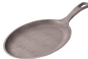
SK10CIH 15.25" X 7.5" X 0.75" Cast Iron Insert