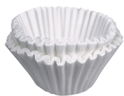
FILTERS,REGULAR1M 500/2 50/CL