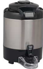
TF SERVER, DSG2 1.5G SST NOBAS