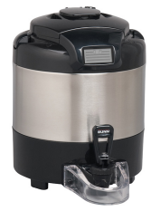
TF SERVER, DSG2 1G SST NOBASE