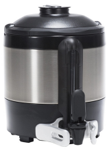
TF SERVER, 1G MECH GEN3 NOBASE