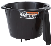
FUNNEL ASSY, SMART COFFEE BLK-CLEARED