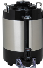
TF SERVER, 1.5G/5.7L MECH NOBASE