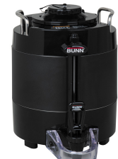
TF SERVER, 1G/3.8L MECH BLK NOBASE