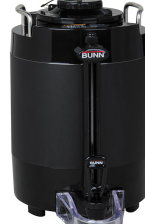
TF SERVER, 1.5G/5.7L MECH BLK NOBASE