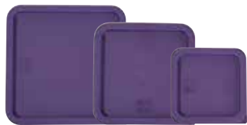
PECC-128P, PECC-68P, PECC-24P

Refer to page 287 for the full Allergen-Free range