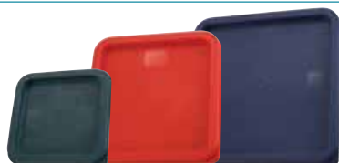
PECC-24, PECC-68, PECC-128