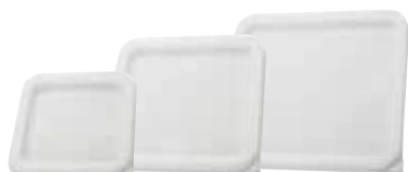
PECC-S, PECC-M, PECC-L