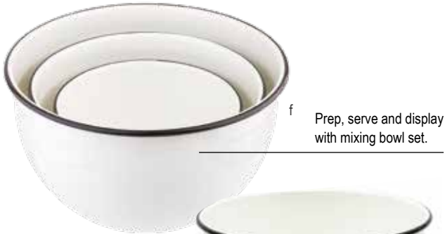
Prep, serve and display with mixing bowl set.