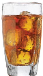
Beverage No. 2488 12 oz./35.5 cl./355 ml. H5¼ T2% B2¼ D3% 3 doz./26# • 1.33 cu. ft. SCC 753857