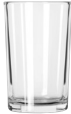
Tumbler No. 1795441 10½ oz./31.5 cl./315 ml. H4% T3 B2½ D3 2 doz./18# • .71 cu. ft. SCC 17954416