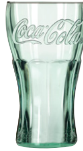
Coca-Cola Genuine Tumbler No. 2216CC 16% oz./49.5 cl./495 ml. H6% T3¼ B2% D3% 1 doz./9# • .63 cu. ft. SCC 280081

COKE® brand glassware is produced for The Coca-Cola Company, owner of the trademarks COCA-COLA, COKE, the design of the contour glass, and Always Coca-Cola by Libbey LLC., an authorized user. ©The Coca-Cola Company. All rights reserved.