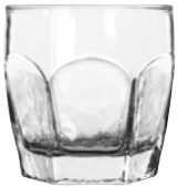
Rocks No. 2485 10 oz./29.6 cl./296 ml. H3% T3¼ B2% D3% 3 doz./24# • 1.12 cu. ft. SCC 753819