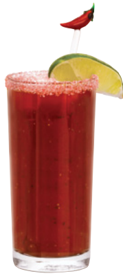
Beverage No. 1790845 12 oz./35.5 cl./355 ml. H5% T2% B2¼ D2% 2 doz./20# • .77 cu. ft. SCC 17908457