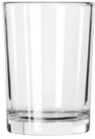
Tumbler No. 1789821 9 oz./27.0 cl./270 ml. H4 T2% B2½ D2% 2 doz./15# • .60 cu. ft. SCC 17898215