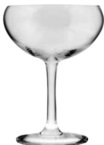
2912UX 12 oz. Margarita H 6 1/8" | D 4 3/8" 2 doz. | 17 lbs. | 2.54 cu. ft.