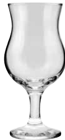
2085M 13 1/2 oz. Poco H 7" | D 3 3/8" 1 doz. | 9 lbs. | 0.69 cu. ft.