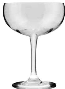
2914UX 14 oz. Margarita H 6" | D 4 1/2" 1 doz. | 9 lbs. | 1.31 cu. ft.