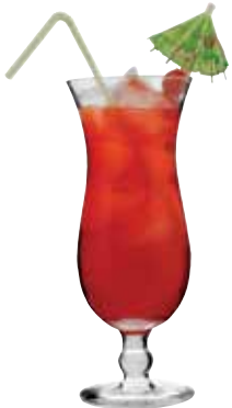
524UX 15 oz. Hurricane H 8 1/4" | D 3 1/8" 1 doz. | 11 lbs. | 0.74 cu. ft.