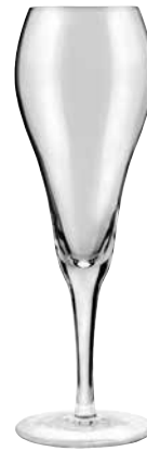
2451RTX 9 oz. Tulip Champagne H 8 1/2" | D 2 3/4" 1 doz. | 7 lbs. | 0.69 cu. ft.