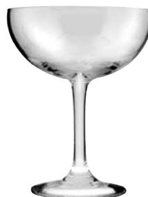
2095UX 15 1/4 oz. Margarita H 6" | D 4 7/8" 1 doz. | 9 lbs. | 1.36 cu. ft.