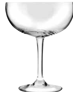
2917UX 16 3/4 oz. Margarita H 6 1/4" | D 5" 1 doz. | 10 lbs. | 1.39 cu. ft.