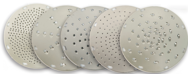
Single plates also available.

The XVSGH housing, XASP adjustable slicing plate, XPH plate holder and XSP316 shredding plate are available as accessory kits and for individual sale.