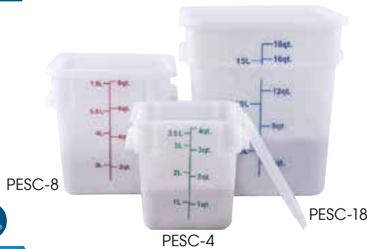
NSF ® BPA FREE PESC-SERIES