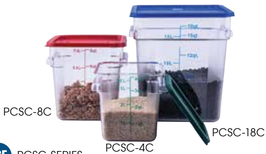
NSF ® PCSC-SERIES