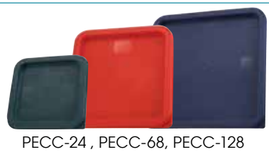
PECC-24, PECC-68, PECC-128