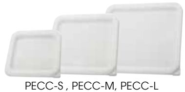
PECC-S, PECC-M, PECC-L