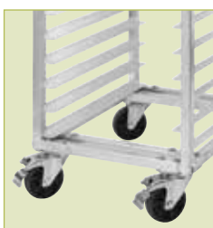
Double crossbars for extra strength