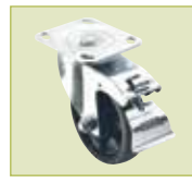
AWRC-5HK 5" plate caster with brake