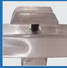
Specialty bolts secure each joint

Winco's exclusive Weld2 System features fail-safe rigidity through both bolting and welding at all critical joints to prevent warping with long term, high-traffic use.