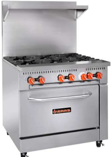
MODEL SR-6-36 (Pictured above) Unit shown with optional casters. Unit ships with legs as standard