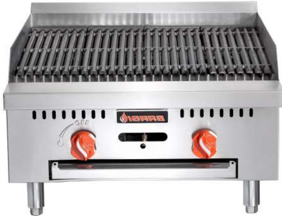
MODEL SRRB-24 (Pictured above)