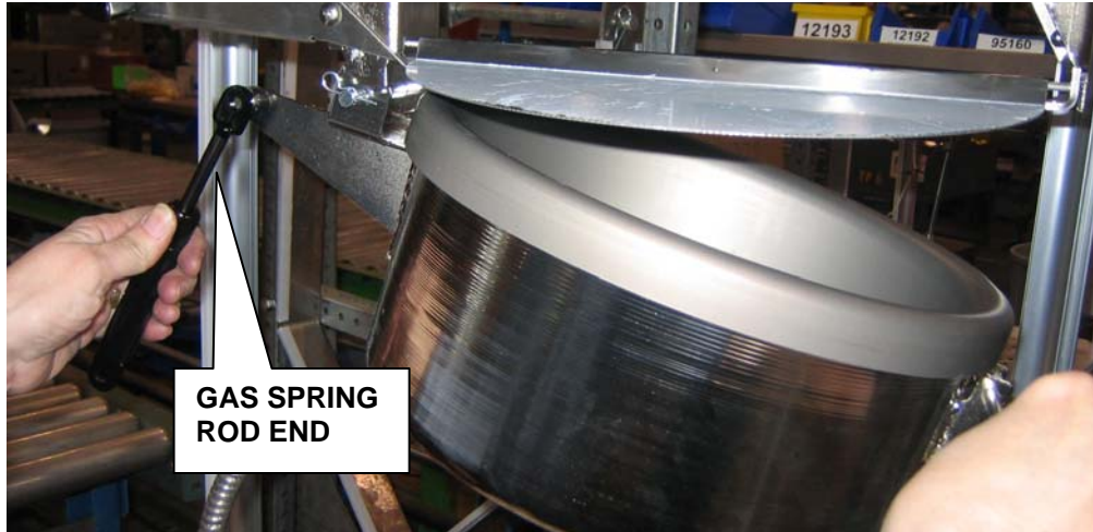
Figure 1: Hang kettle and attach gas spring.