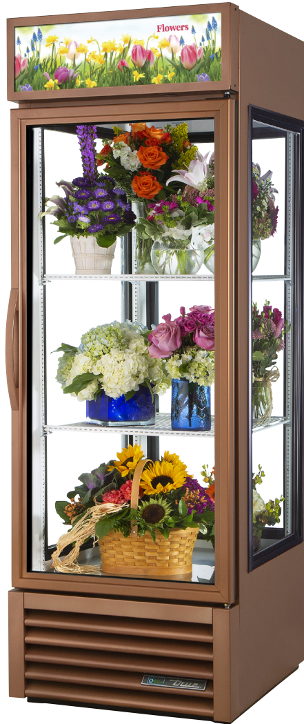
Shown with optional Copper Exterior.

Swing Door Refrigerator with Hydrocarbon Refrigerant~True Standard Look Version 01