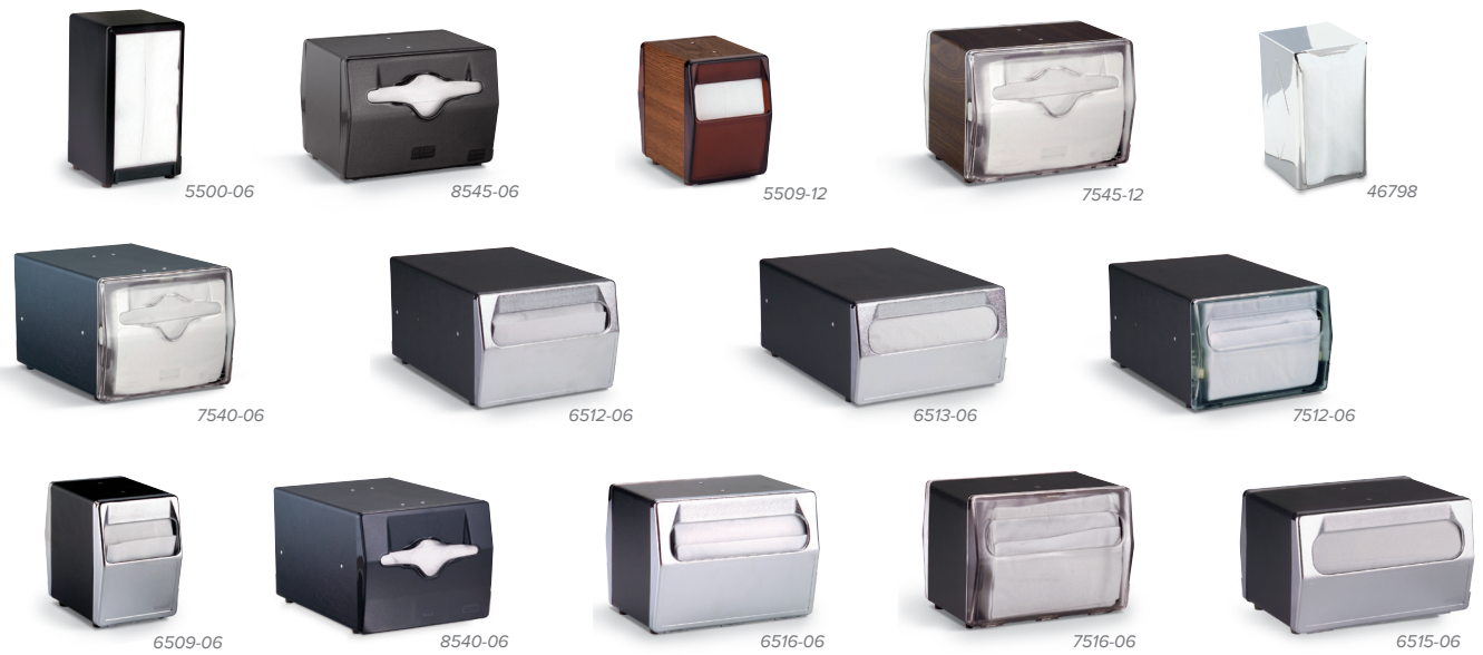
Table & Countertop Napkin Dispensers