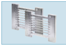
OS-250B Blade set assembly