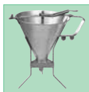
SF-7 & SF-7R