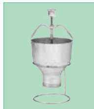
APCD-6 & APCD-6R