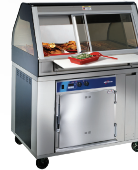
*Shown with optional Cook & Hold oven system