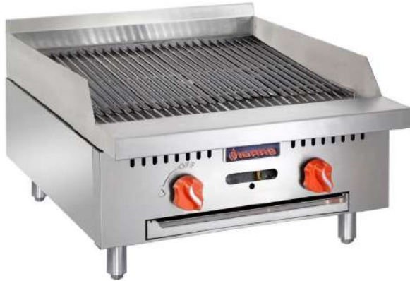
MODEL SRRB-24 (Pictured above)