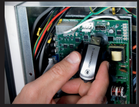
USB Port Firmware Updates