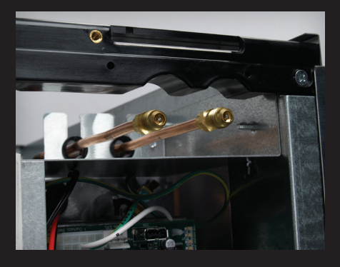
Easy Frontal Service Access Ports