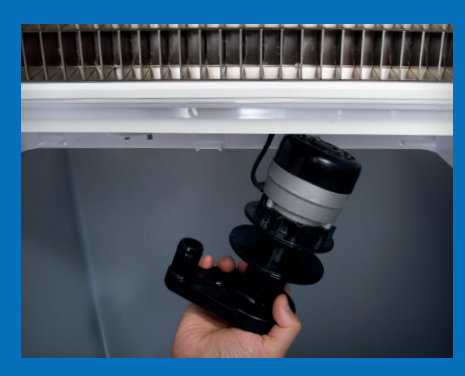
Snap-fit water pump