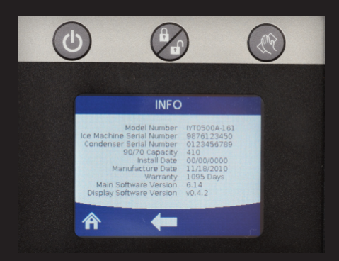
One touch machine info