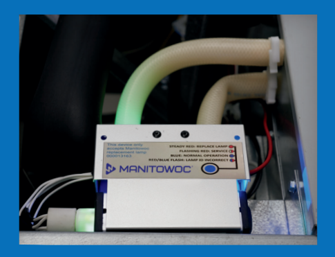
LuminIce II Growth Inhibitor accessory

the machine (Based on reducing one cleaning per year over a 10 year life of