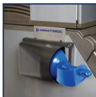
Horizontal left entry bin mount