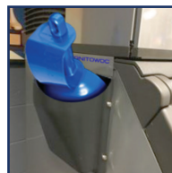
Vertical left side bin mount