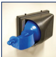
Horizontal right entry wall mount