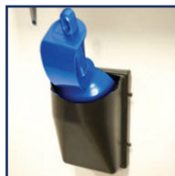
Vertical wall mount