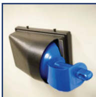
Horizontal left entry wall mount

Optional hanger K00482 is required if using with F-Bins or LB-Style Bins.