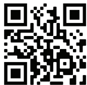
(Bin Mount Video QR)