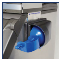
Horizontal right entry bin mount