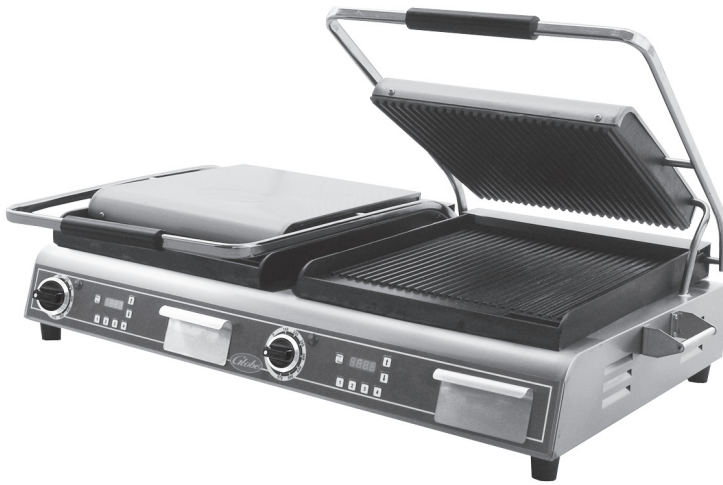
Model GPGDUE14D Shown