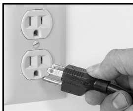
Fig. 6-1 Correct

THIS MACHINE IS PROVIDED WITH A THREE-PRONG GROUNDING PLUG. THE OUTLET TO WHICH THIS PLUG IS CONNECTED MUST BE PROPERLY GROUNDED. IF THE RECEPTACLE IS NOT THE PROPER GROUNDING TYPE, CONTACT AN ELECTRICIAN. DO NOT, UNDER ANY CIRCUMSTANCES, CUT OR REMOVE THE THIRD GROUND PRONG FROM THE POWER CORD OR USE ANY ADAPTER PLUG (Fig. 6-1 and Fig. 6-2). (Outlet and plug shown below are a representation and may not reflect the correct NEMA plug / outlet for this piece of equipment. It is shown to disallow use of unauthorized adapters.)