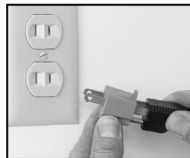
Fig. 6-2 Incorrect