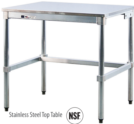
Stainless Steel Top Table NSF

Design one to meet your individual needs. The number of possible configurations is endless.