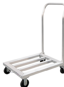
52781 | Mobile Dunnage Rack With Handle - use with 1199 Drag Hook

We build a variety of carts to transport, store and more!