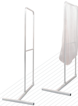
53171 | Bio Barrier

Free-Standing, portable Sanitation Units give you the flexibility to station your hand sanitation where it's needed the most.