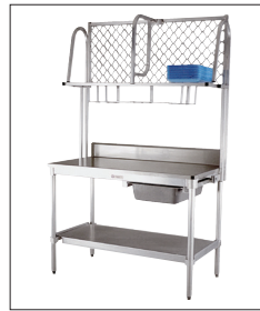
Backsplash, Boat Rack, Drawer, Paper Holder, Platter Holder, and Undershelf Options Available.