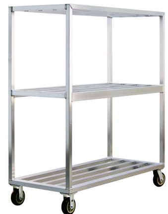
1152 | Boxed Beef Truck NSF