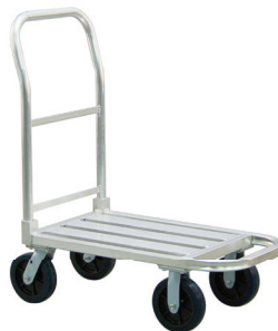
99320 | U-Shaped Platform Truck