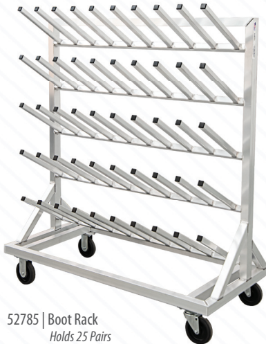
52785 | Boot Rack Holds 25 Pairs