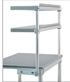
Shown with Optional Cantilever Overshelves.