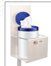
53179 | Sanitizer Stand