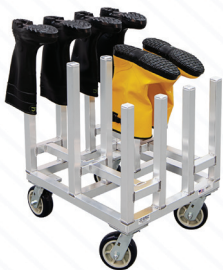
52655 | Boot Rack Holds 6 Pairs