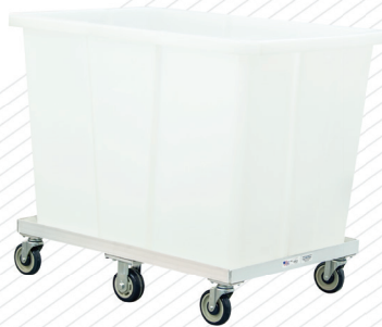
Mega Mover 51622 | Dolly 0820 | Tub - 20 Bushel