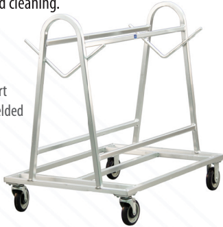
99360 | Mat Cart - All Welded