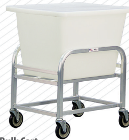
Bulk Cart 99272 | Dolly 0363 | Tub - 6 Bushel

Two Piece Design Allows Easy Cleaning of Dolly Base & Tubs!