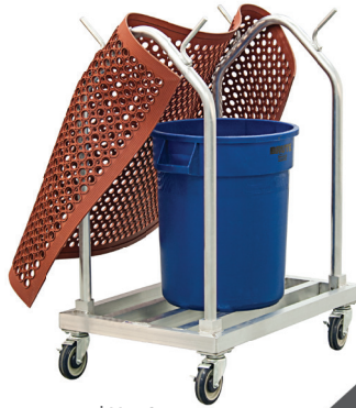
51087 | Mat Cart - Knock Down