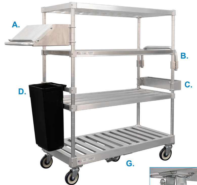
C699 Spring-Loaded Caster (Option 5X)