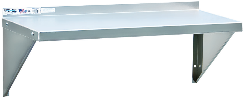
Solid Wall Shelf • H.D. & Standard