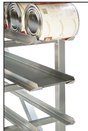
1255 Solid Shelf Trays