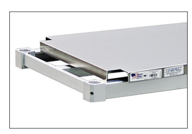
Solid Brute Shelf -- Removable Top

This information is for general sales and engineering use only. New Age Industrial reserves the right to modify or make changes at any time without notice to materials and specifications. Made in the USA