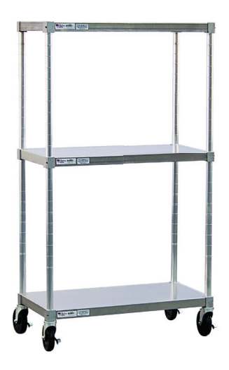
Adjustable Unit with Casters