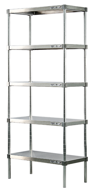
Adjustable Stationary Unit