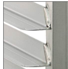
6000 Series Angle Guides and Welds