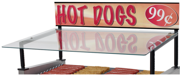
50SG-G with optional sign holder