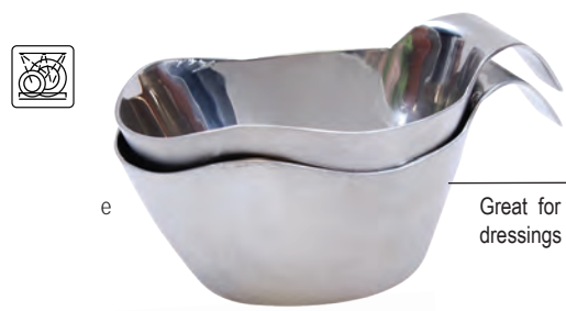
Great for condiments, dressings or sauces!