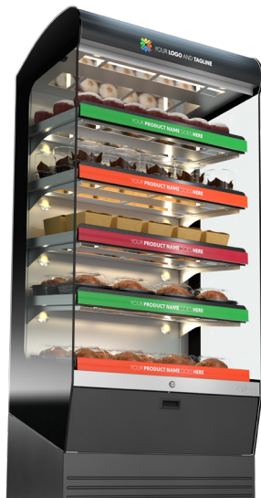
HSM-36/5S/T Shown with custom graphics.