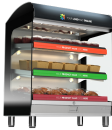
HSM-36/3S/T Shown with custom graphics.