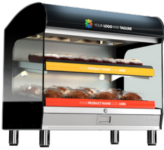
HSM-36/2S/T Shown with custom graphics.