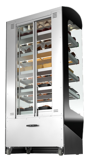
* Swing or Slide Back Door Optional