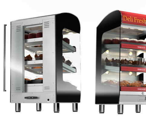
* Swing Back Door Optional