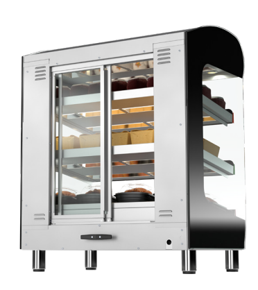
* Swing or Slide Back Door Optional