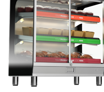
Shown with custom graphics & Front Door Option.