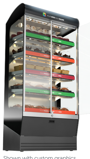
Shown with custom graphics & Front Door Option.