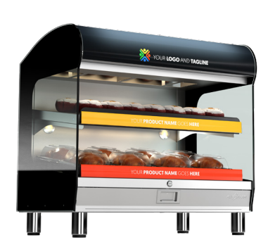
Shown with custom graphics.