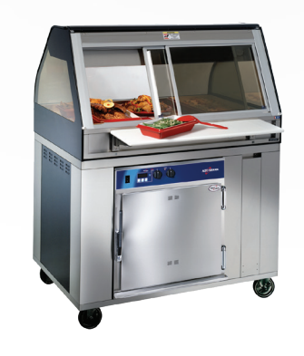
*Shown with optional Cook & Hold oven system