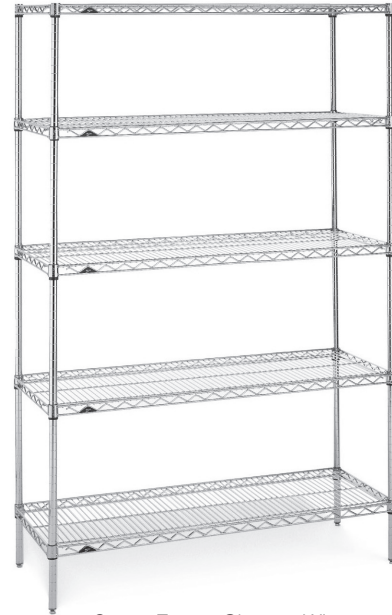
Super Erecta Chrome Wire

Note: Stainless stationary posts are equipped with stainless steel leveling feet.