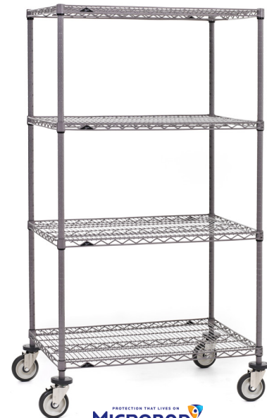
Super Erecta with Metroseal