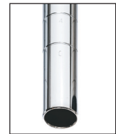
Post for Stem Caster