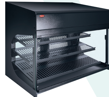
FS3HAC-4226 with optional tiered shelves