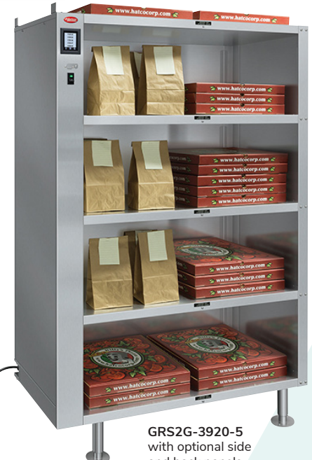
GRS2G-3920-5 with optional side and back panels