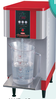
AWD-12 Pitcher not available