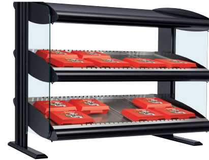
HXMS-36D in standard Designer Black

Hatco Heated LED Merchandisers are sleekly designed to safely hold hot packaged food to attract grab-and-go customers. Available in slant or horizontal shelves, the Heated LED Merchandisers are offered in both single and dual shelf models.