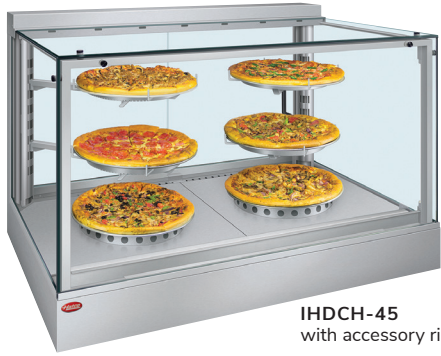
IHDCH-45 with accessory risers