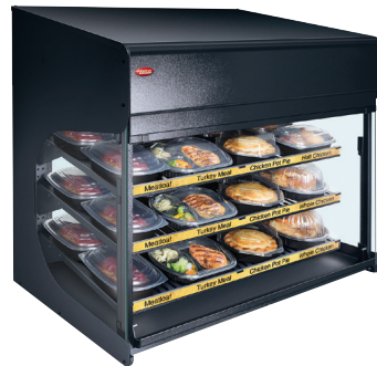
FS3HAC-3626 shelf signs not included