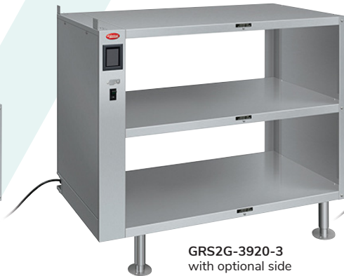
GRS2G-3920-3 with optional side panels