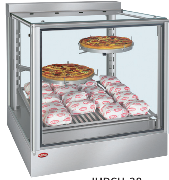
IHDCH-28 with accessory adjustable arms and shelf

Intelligent Heated Display Cabinets with Humidity can help you express your food presentation creativity! With a 360° view and energy-efficient LED lighting to show off food products, the IHDCH units will easily grab customers' attention. Plus, the food can only be accessed by a server, which will help keep your customers safe.