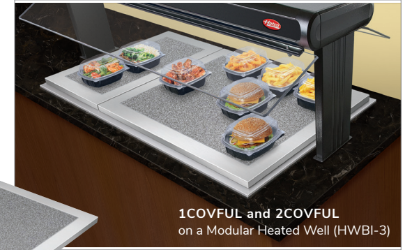
1COVFUL and 2COVFUL on a Modular Heated Well (HWBI-3)

Hatco Heated Well Covers help keep revenue flowing by converting Hatco drop-in heated wells to grab-n-go holding solutions for pre-packaged hot prepared foods. Then easily convert them back when the time is right. Finding a second use for equipment is even more vital in this time and we are here to help find new ways to use what you have, and make sure you have what you need.