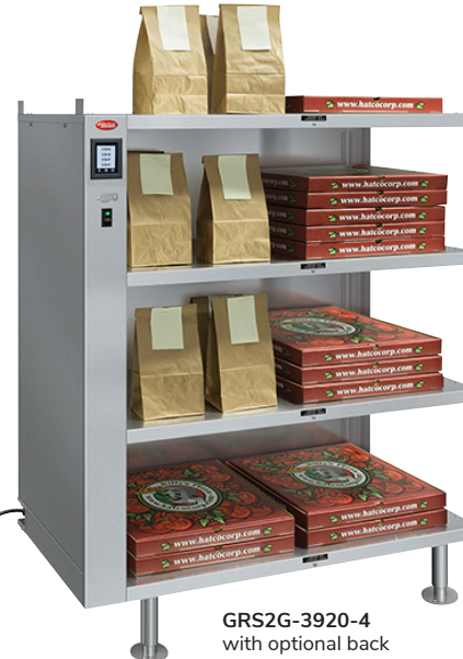
GRS2G-3920-4 with optional back panels