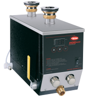
3CS2-3 with optional auto-fill solenoid