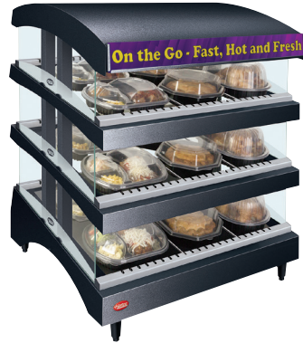
GR3SDS-27TCT in standard Designer Black and sign holder (sign not included)

Hatco Glo-Ray® Heated Glass Merchandisers show off your wrapped or boxed food product - even to the back of the shelf - with unique, patented heated glass shelves that conduct heat to food product above and below. To-go and impulse sales for individually wrapped sandwiches and meals that are stored at safe temperatures are as important as ever. Our merchandisers display hot and fresh food products at their very best.