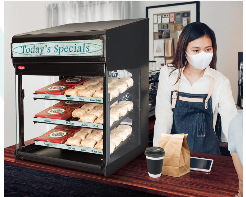
FS3HAC-2426 with standard shelf sign holders and optional top sign holder (sign not included)