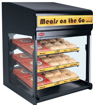
FS3HAC-2426 with optional square side cut-outs and top sign holder (signs not included)